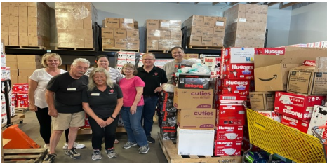
AJ's Angels—Diaper Bundling