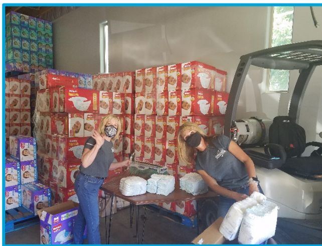
First Interstate Bank in Eagle spent their Volunteer Day at Idaho Diaper Bank making bundles!